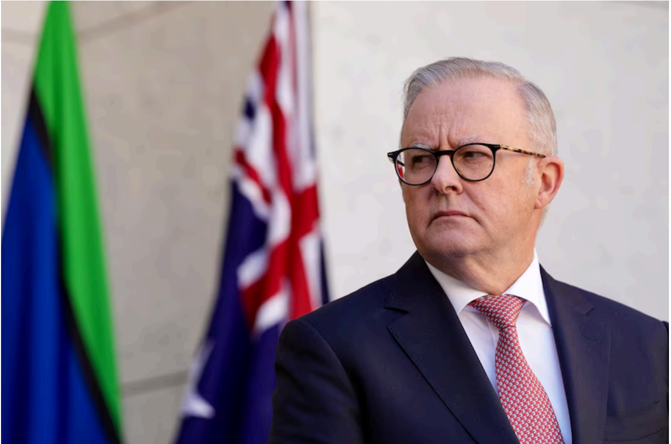
Anthony Albanese is declining to comment on the investigation into Mr Roberts-Smith.

Prime Minister Anthony Albanese also declined to comment when asked whether the Commonwealth Director of Public Prosecutions had sought authorisation from the federal government before Mr Roberts-Smith's arrest.