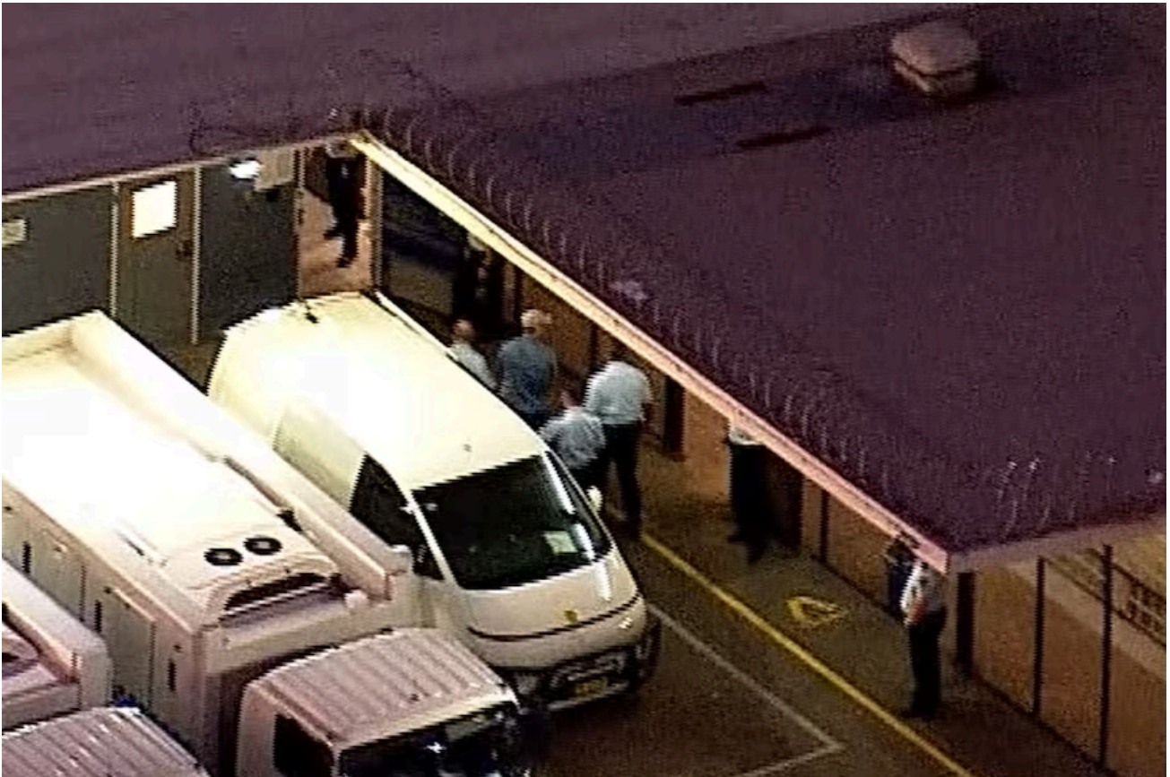
Ben Roberts-Smith was charged and taken to Silverwater Prison Complex on Tuesday.

He was taken to Silverwater Prison Complex in the city's west, where he will remain in custody and is due to appear in Bail Division Court on Wednesday.